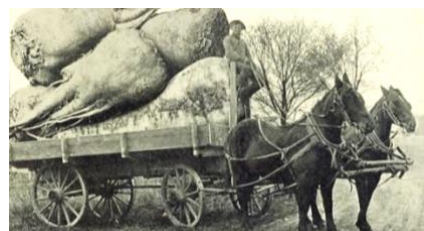
Early advertising sometimes featured larger-than-life vegetables, such as sugar beets (left), onions (up right) and potatoes (right).

These days you'd have to live under a rock to not feel assaulted by advertising. It's everywhere! Algorithms assure that our (or at least our children's) attention will fixate upon a subject for as long as possible.